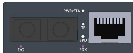
Fig. 1 Dual Fiber Front Panel of MCT-3512