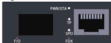
Fig. 2 WDM & SFP Front Panel of MCT-3512