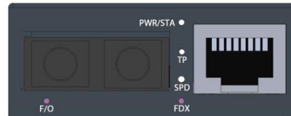
Fig. 1 Dual Fiber Front Panel of MCT-100 Converter