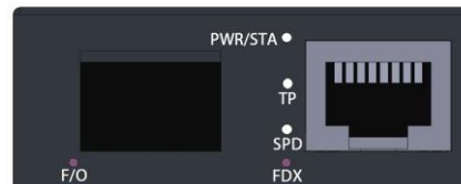
Fig. 2 WDM & SFP Front Panel of MCT-100 Converter